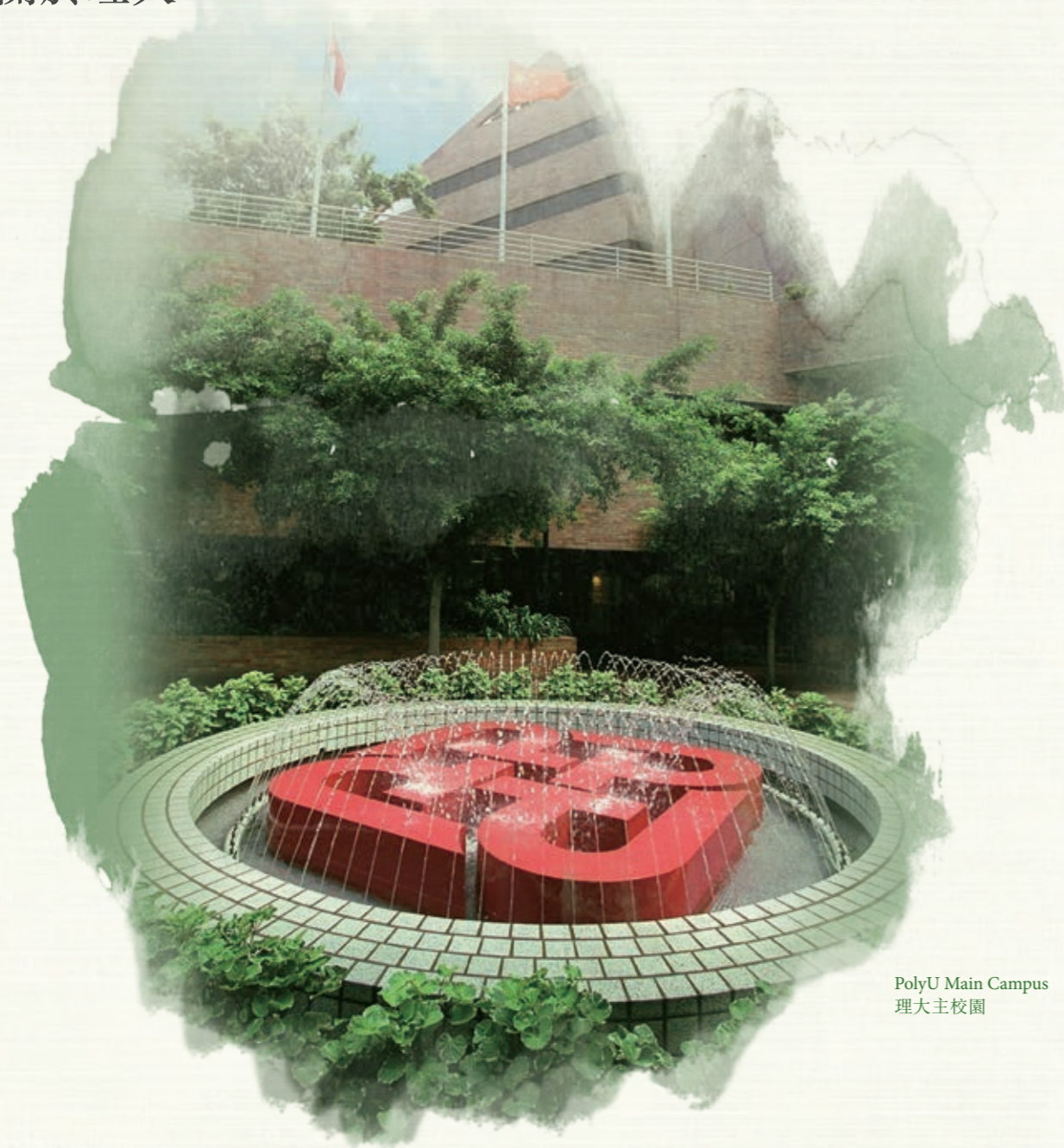
PolyU Main Campus 理大主校園

As one of the largest government-funded tertiary institutions in Hong Kong in terms of student number, PolyU offers a wide range of taught and research programmes at Doctorate, Master's, Bachelor's degrees and Higher Diploma levels, with a total expenditure budget close to 5 billion Hong Kong dollars per year.